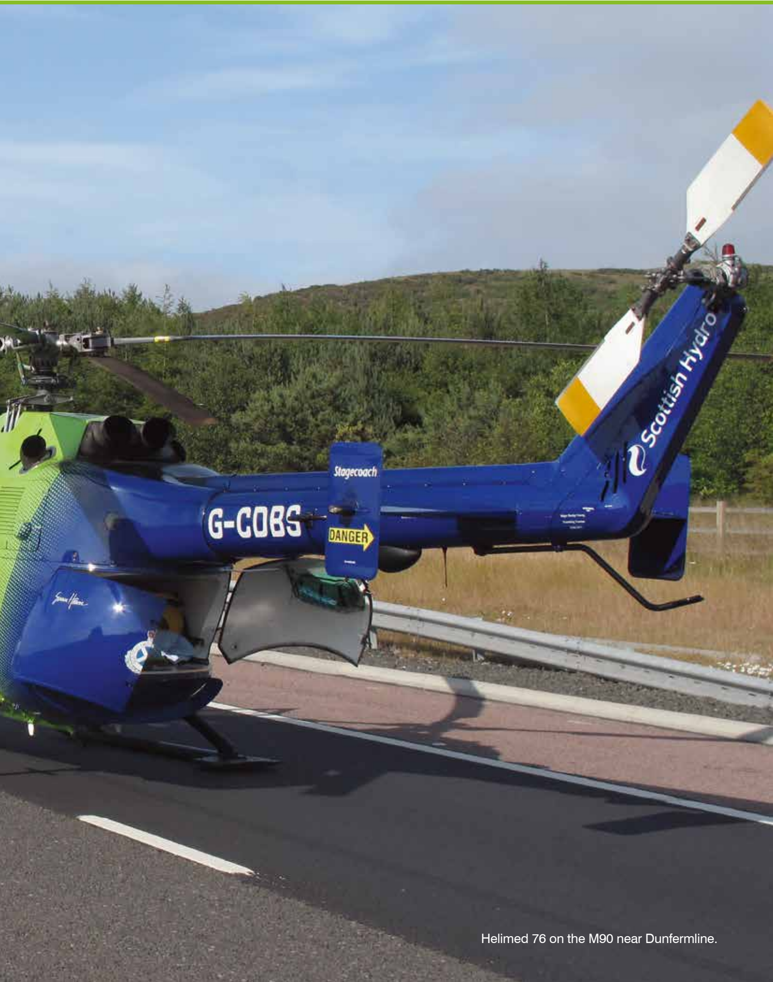
Helimed 76 on the M90 near Dunfermline.